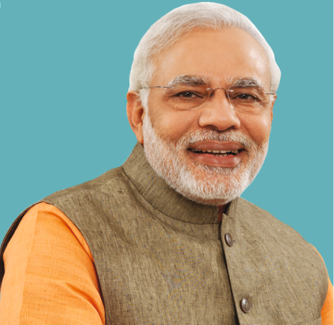
Shri Narendra Modi Hon'ble Prime Minister