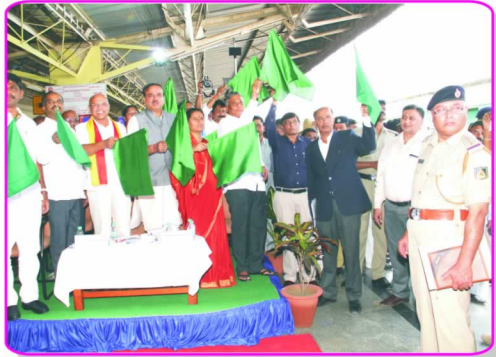
Shri D.V. Sadananda Gowda, Former MR seen flagging off 3 pairs of trains viz., between Yesvantpur-Nelamangala-Yesvantpur, Yesvantpur-Hosur-Yesvantpur & Bangalore City -Tumkur-Bangalore City at a function held at Yesvantpur Rly. station on 01-11-2014. Shri Ananth Kumar, Union Minister of Chemicals & Fertilisers & other dignitaries are seen.