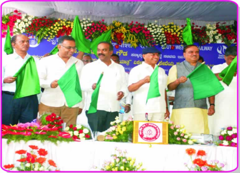
Shri D.V. Sadananda Gowda, Former MR seen flagging off Sukhamangalam Yatri Special and Inauguration of Wi-Fi at Bangalore Railway Station on 25-10-2014. Shri Ananth Kumar, Union Minister of Chemicals & Fertilisers and other dignitaries are also seen.